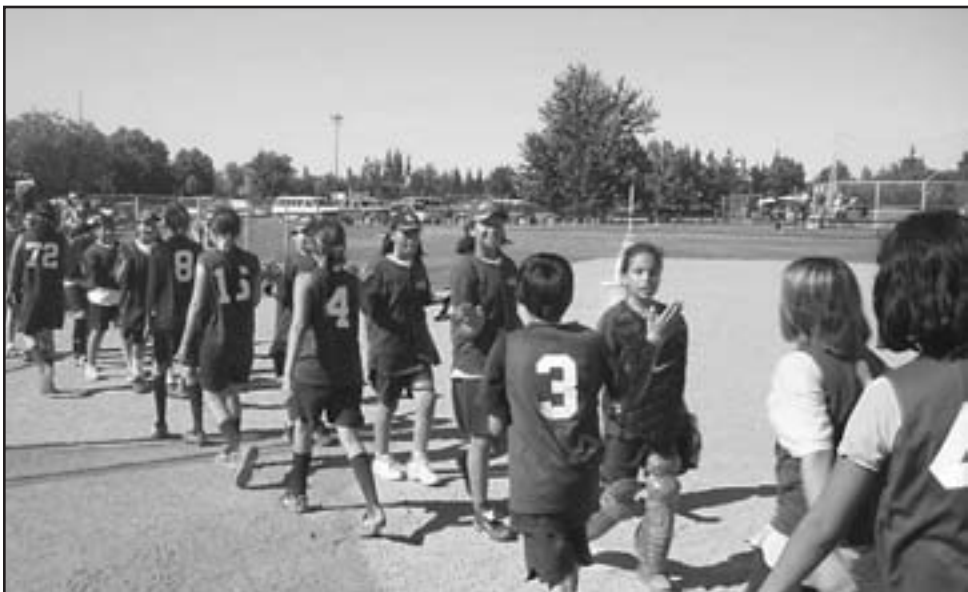
PAGC and Meadow Lake Tribal Council squirt girls shake hands after a Prince Albert win at the 2007 First Nations Summer Games.