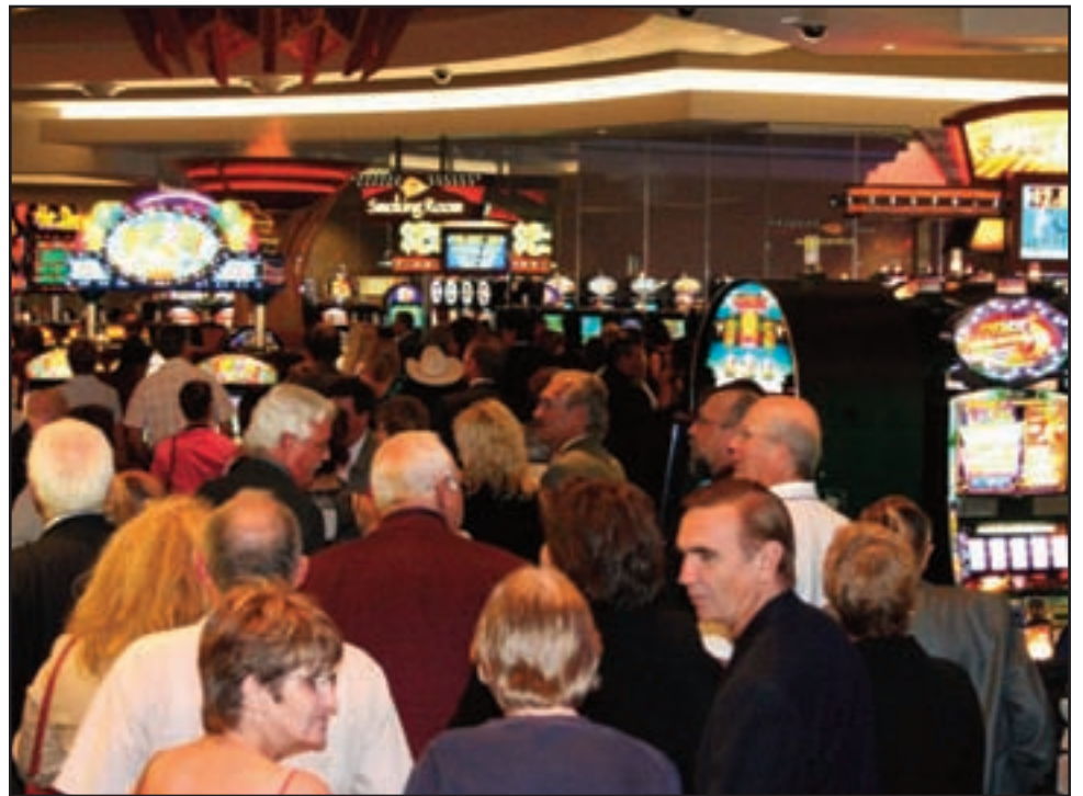
It was standing room only on opening night at the Dakota Dunes Casino on August 9.