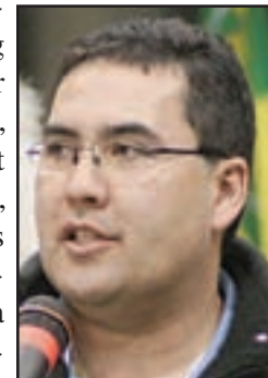
MP Gary Merasty

There has been some speculation that Merasty will wind up working for Saskatchewan uranium giant Cameco.