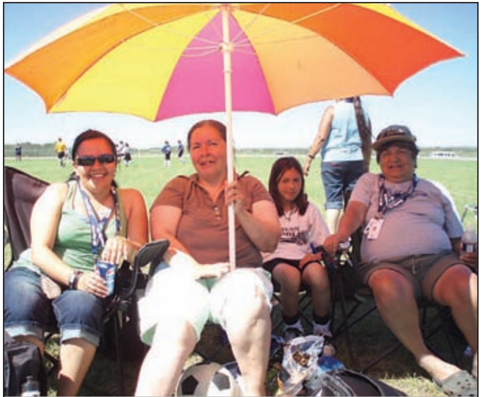
Fans would do anything to stay cool in the plus 35 Celsius weather.