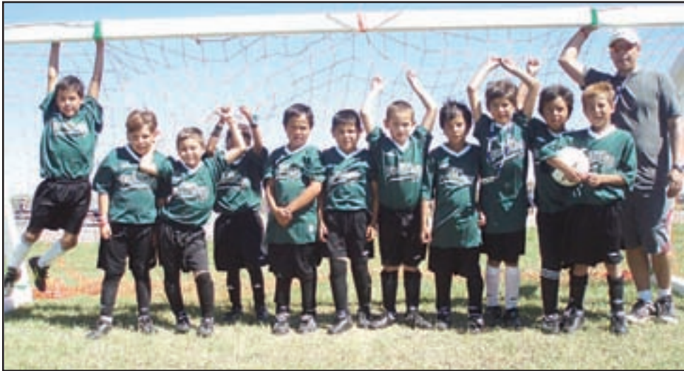
Woodlands 10 and under boys soccer team hangs out between games.