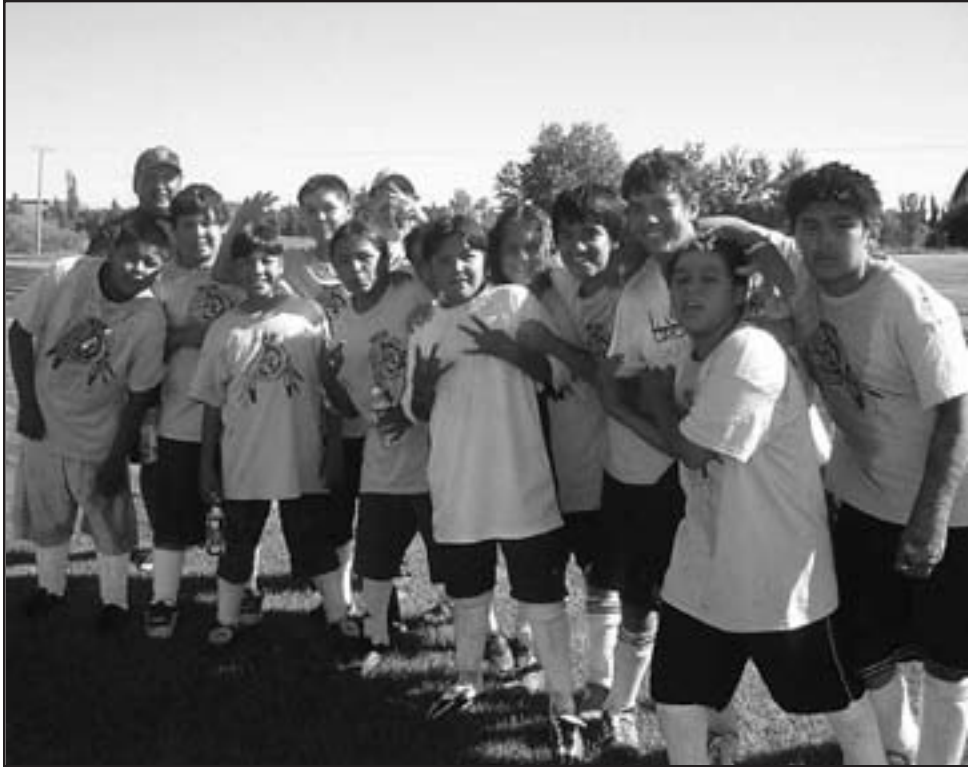
Agency Chiefs pee wee soccer boys put their best foot forward for the Eagle Feather News photographer. Agency Chiefs Tribal Council went on to win the overall title.